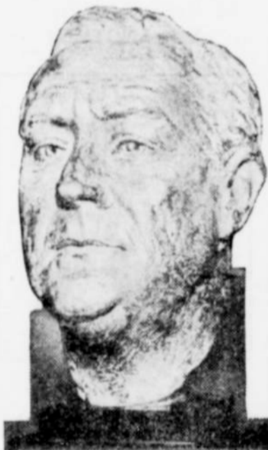
This forceful bronze bust of President Roosevelt, now on display in a New York art gallery, is the work of Jo Davidson.