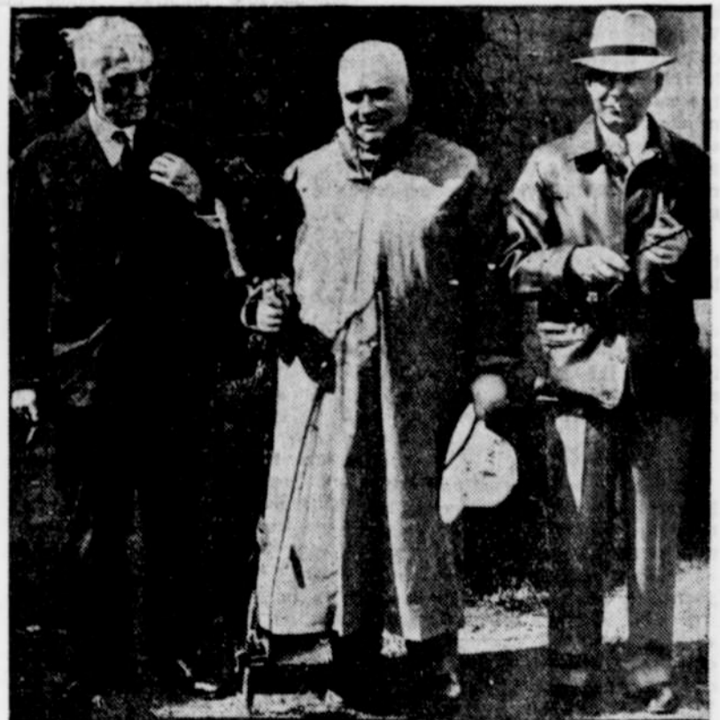
Left to right: Gov. Charles M. Smith of Vermont, Gov. Harry Nice of Maryland and Gov. Louis J. Brann of Maine, photographed at Moosehead lake, Maine, while they were enjoying a fishing trip. Mr. Brann was the host.