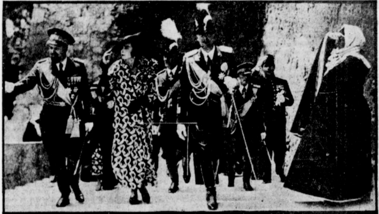
This picture, made at Tripoli, Italian Libya, shows the crown prince and crown princess of Italy, with Marshal Balbo, governor of the territory, who is pointing out to them the interesting sights off that African possession.