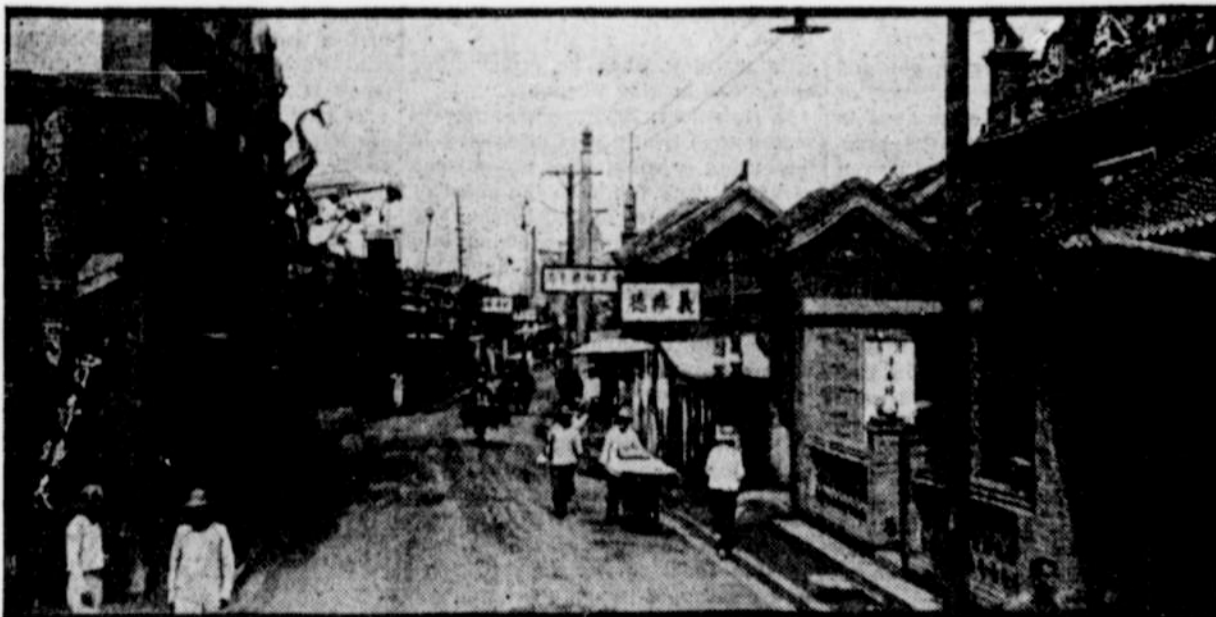
View in the Portuguese seaport of Macao, on the China coast, for which it is reported Japan has offered $97,400,000. Macao is 35 miles across the mouth of the Canton river from the British port of Hongkong.