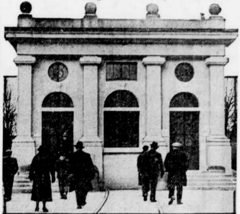
This is the new Armistice temple built with funds provided by a wealthy American and standing in Compiègne forest in the north of France, near the spot where in 1918 the delegates of the allies and Germany met and signed the armistice that ended the World war.