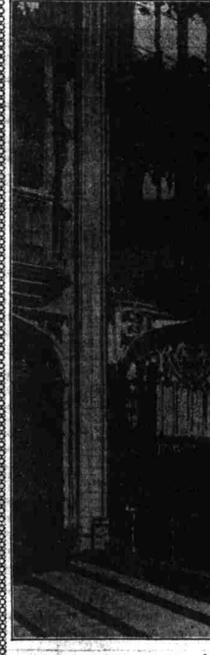
St. George's Chapel is the chapel in the Palace at Windsor where the royal family attend divine services when they are in residence at the castle. The pew in the foreground is known as the Queen's pew.