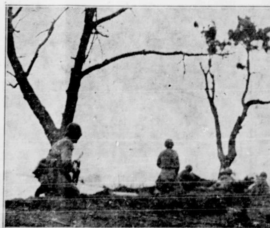
FIRST MARINES IN FRONT LINE ACTION —Under the gnarled trees on the island of Wolmi these Leathernecks wipe out the remaining North Koreans in the advance on Inchon. This individual action was typical of the fighting in the capture of Seoul, and in the advance above the 38th parallel.