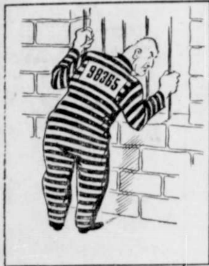
Some numbers don't change

The kite was not a home-made affair but of a commercial make. Its tangle with the power line cut off service and could well have spelt sorrow to the lad at the end of the string.