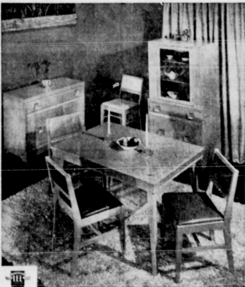
Available in "Green" or "Rose" Seats