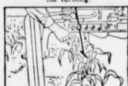
Easily adjustable front axle steering guide permits accurate front steering.