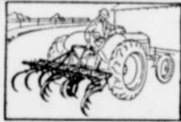
With Ford Triple-Quick Attaching, cultivator goes on in about a minute.

Some folks say a cultivator ought to "let air into the soil," "help retain moisture" etc. We say you cultivate to get rid of weeds. The other things are important, but knocking out weeds is number one. And we'll show you the cultivator that does it. What's more, this cultivator can be attached to the Ford Tractor in about a minute! Now, that is a big advantage... especially when changing from cultivating to mowing and back again. Time surely is money now. Study the pictures! See how easy cultivating is with Ford Hydraulic Touch Control. Let us demonstrate this cultivator for you... Rigid or spring shanks.