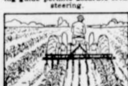
Hydraulic Touch Control sets shanks or boards for uniform working depth.

CATE MOTOR CO. 126 E. PACIFIC AVE. PHONE 174 FOREST GROVE, OREGON