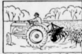
Ford Hydraulic Touch Control makes it easy to lift the cultivator for turning.