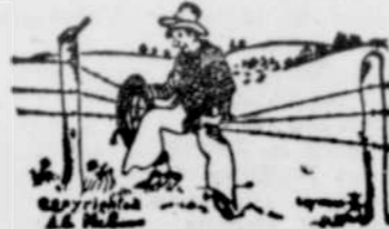
Three Eggs a Month

Have you looked over the ads this week? If not do so, they carry a world of news.