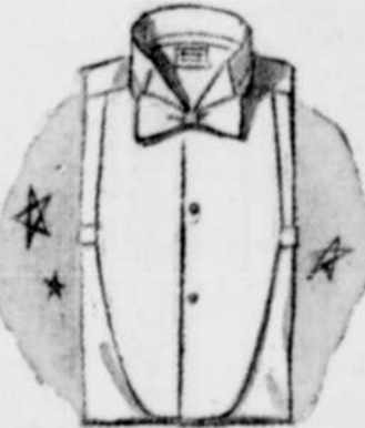
ARROW KIRK , for formal wear, has a narrow bosom that's held in snug against you by suspender loops. It won't balloon out when you wear it! $2.50 Give yourself Arrow Dress Shirts. They're as comfortable as they're good-looking... they're a far cry from the armor plate of yesteryear!