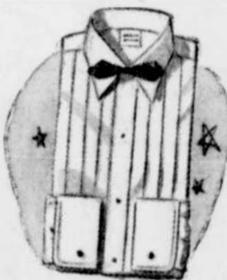
ARROW SECRETAN For less formal events, has a semi-soft attached collar and semi-soft pitted bosom... last word in smart looking comfort! $3