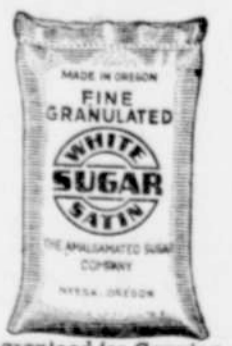
Guaranteed for Canning

Oregon Sugar is made in America's newest and most modern sugar factory. It is the best sugar you can buy and is guaranteed for canning and every sweetening purpose.