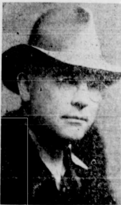
I'd like to Meet You and Talk Things Over