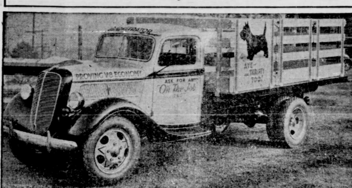
To prove that the new 1937 Ford V-8 trucks are all that they are claimed to be, Ford dealers throughout the state are placing in service for demonstration use specially-painted 157-inch stake heavy duty units with dual wheels. Ford trucks of this type are widely used on operations ranging from farming to freight-hauling.