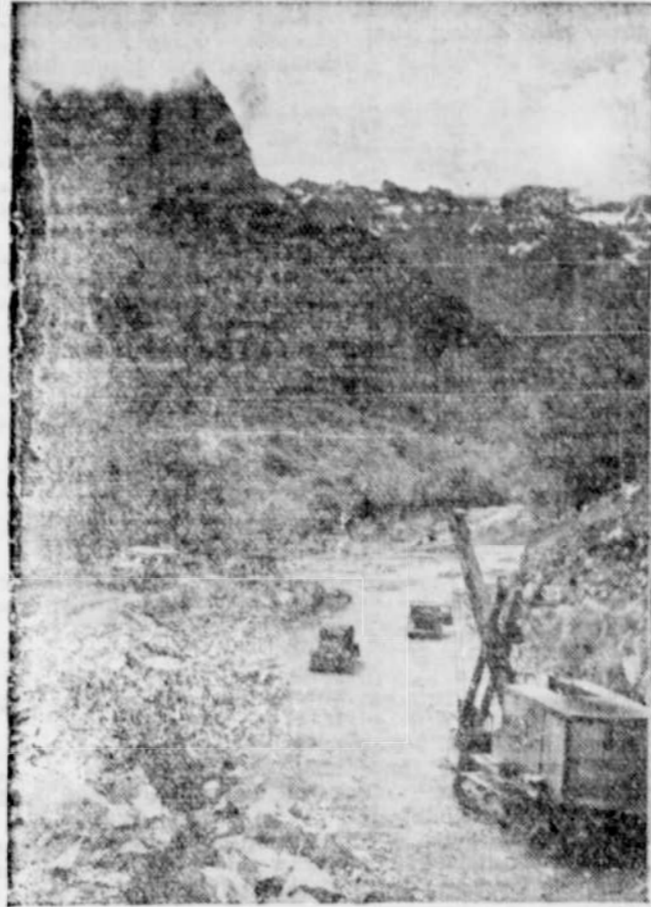
ABOVE—Washington speeds big cut in Granite formation on Stevens Pass high-gear highway, through Cascade mountains.