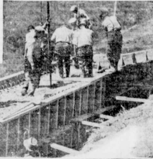
ABOVE—Southern California tunnel on Sepulveda boulevard. It gives access to the valley highway, No. 99, from south and west coast cities and resorts.

Today, motorists are seeing the entire Pacific region, and enjoying its matchless scenic grandeur as never before. Pictures herewith, show just a few of the highway projects which more firmly establish the Pacific's right to the title "America's Playground."