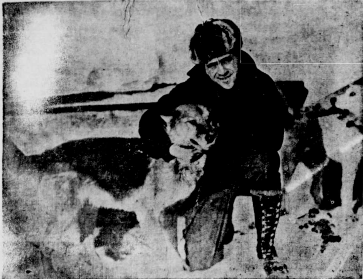
THE GLACIER PRIEST AND ONE OF HIS SLEDGE DOGS