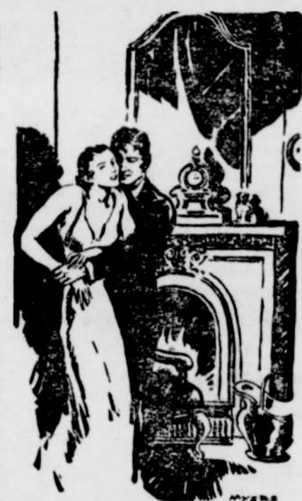
Mary Tried to Struggle Away From Him, Hot With Fury, Sick With Shame and Disgust.

Paul seemed hardly to hear her. But there was no doubt that he saw her and that he found her very good to look at. Philip had once said that Mary was lovely always, but that if she ever got angry, she would be magnificent. Mary was very angry now, so angry that she hardly knew what she was wounded to the heart as well. She was, indeed, magnificent, beautiful as Paul had never seen her, had never known she could be. He threw his arms around her, and began to