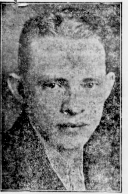
DONALD T. TEMPLETON Candidate for Republican Nomination For County Judge

Washington — About 34,000 more babies were born during 1930 than during the preceding year, according to figures from the Labor Department. More than 6,300,000 copies of the Children's Bureau pamphlets "Infant Care," were distributed during this period.