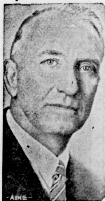
GEO. A. PALMITER

Republican Candidate for Nomination for Secretary of State