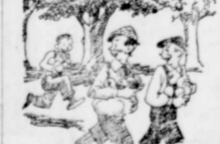
THE ANNUAL HARVEST

Sutherlin—New fire truck added to local fire department.