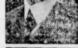
W. R. MOREHOUSE

THE fabulous salaries paid stars of the first magnitude, and the publicity of the "movies" naturally create longing in the breasts of thousands of our young Americans to get into motion pictures. Because so many are ready to leave home, and risk everything on a fling at motion pictures, unscrupulous persons have devised ways of fleecing these ambitious young people out of their savings. "Hokum-pokum" schemes of various kinds are used with great success. Fake courses in the art of acting before the camera, fake courses on how to make-up, fake registration gags and screen tests, are among the schemes used to separate these thousands of young people from their cash.