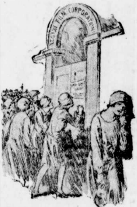
The Pilgrimage to the Movies

So-called estate schemes which have produced thousands of "heirs" and at a