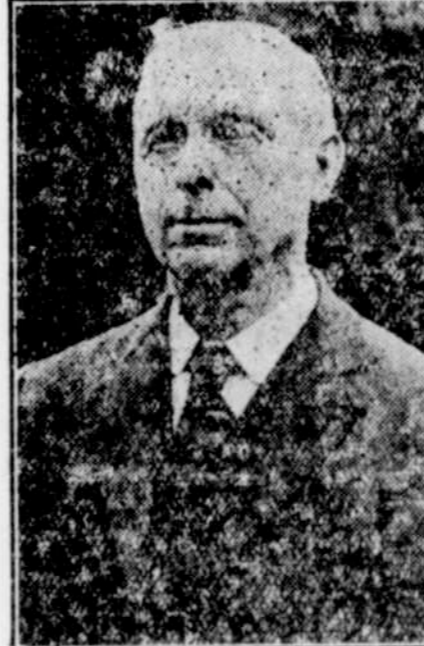
Candidate for Republican Nomination for County School Superintendent (Paid Advertisement)