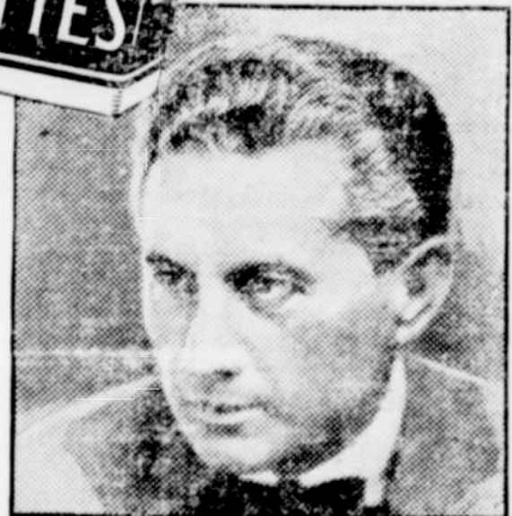
FRED NIBLO Photoplay Director, writes:

"To a moving picture director there is no comfort or luxury like a good cigarette. Such a cigarette I have found in 'The Lucky Strike'—and during the filming of big pictures like 'Ben Hur' I smoked 'Luckies' even while directing in the open air thousands of supernumeraries, and never once did I ever suffer from throat irritation."