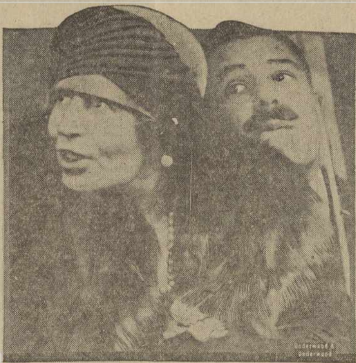
Queen Marie of Rumania in the pilot house of the S. S. Macom getting her first glimpse of lower New York.