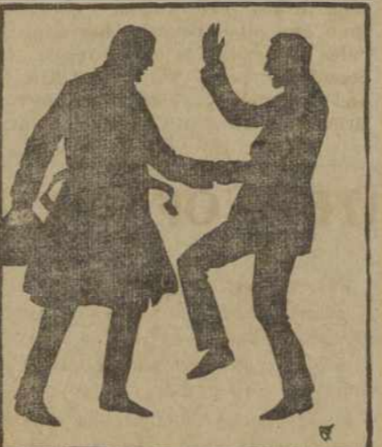
But Walter Moore Got No Further With His Explanation.

John did not answer. He felt sick with misery and disappointment. Every word that Jean uttered made the telling of the thing all the harder.