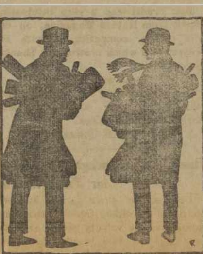
"Why, Moore," He Said, "You in a Hurry, Too?"

Everywhere within view a surging mass of humanity moved this way and that, all with eager, intent faces—the hurrying, nervous, yet glad some crowd of last-minute Christmas shoppers. John's progress was slow as he tried to elbow his way along, and because of the fact that a number of packages nestled in the folds of his arms, all of them bearing the hall-mark of Christmas time. One in particular, however, seemed to be singled out in a special manner from the rest, in that it rested on that part of John's overcoat where his heart was supposed to be located and that every minute or two he felt it with the little of his finger tips that were available. A smile played about the corners of his mouth as he thought of the moment that the package would be opened and the little cry of delight that Jean would surely give when she gazed on its contents. For was there not reposing there the very gift that he knew she wanted most—had he not heard her express the wish for it just a week before as they stood window shopping outside Bolton's store: "What a beautiful cape," she had exclaimed; "some woman will surely be happy Christmas morning when she receives it. But I—"