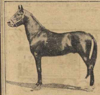
Carnegie, a Well-Conformed Type.

Common unsoundnesses are splints, thoroughpin, spavin, curb, extreme fl-