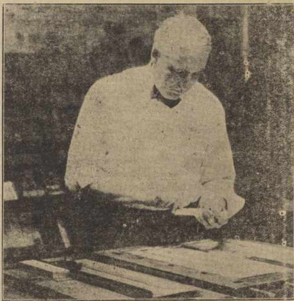
Senator Warren G. Harding, Republican nominee for President, is thoroughly familiar with the imposing stone and can "make-up" rapidly and skillfully. Here he is shown "making-up" forms in the composing room of his newspaper, the Marion (O.) Star.

The attorney-general has notified the state highway commission that it is unlawful for any person to place advertising signs (printed, painted or written), bills, notices, signs, pictures, cards, or posters on any building, fence, gate, bridge, tree, rock, board, or structure within the limits of any state highway. He also states that it is lawful for any person to remove such signs, etc. It is probable that the Highway commission will order this practice of posting advertisements and other notices on the state highways stopped, and, perhaps, order those already there removed. At all events all signs except road notices should be forbidden at corner roads where signs are posted.