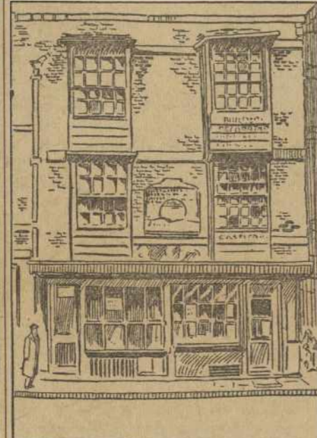
Where Milton Lived.

The house where Benjamin Franklin lived is no longer in existence. As the old verger of St. Bartholomew said, "It's been completely metamorphosed