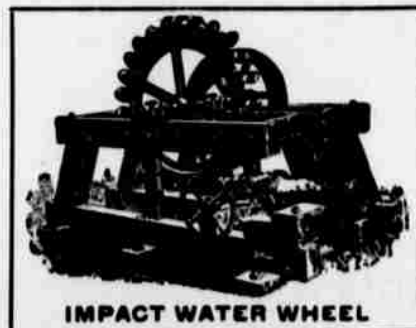
IMPACT WATER WHEEL

Quartz Mining and Milling Hoisting, Pumping and Saw Mill Machinery, Hydraulic Mining Machinery, Giants, Water Gates and Hydraulic Riveted Pipe. Water Wheels and Water Motors, Engines, Boilers, Pumps and Machinery of every description. Prospecting Machinery.