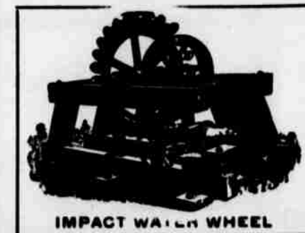
IMPACT WATER WHEEL

Quartz Mining and Milling Hoisting, Pumping and Saw Mill Machinery, Hy- draulic Mining Machinery, Giant, Water Gates and Hydraulic Riveted Pipe. Water Wheels and Water Motors, Engines, Boilers, Pumps and Machinery of every description.