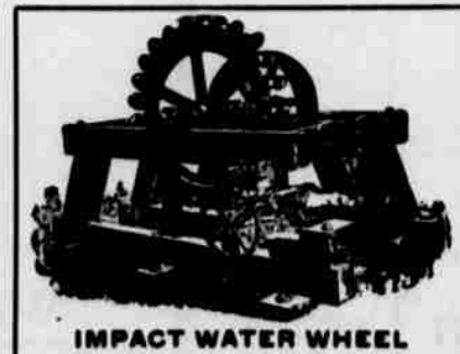
IMPACT WATER WHEEL

Quartz Mining and Milling Hoisting, Pumping and Saw Mill Machinery, Hy- draulic Mining Machinery, Giants, Water Gates and Hydraulic Riveted Pipe, Water Wheels and Water Motors, Engines, Boilers, Pumps and Machinery of every description.