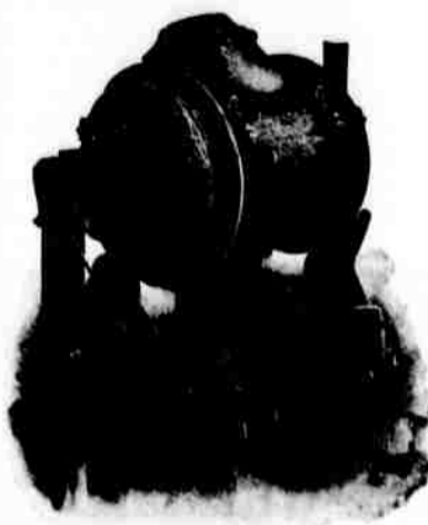
80-in x 120-in. Copper Converter.

BRANCH OFFICE: SPOKANE, WASH. 110 MILL ST.