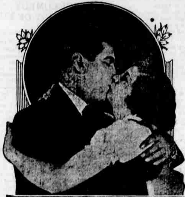
MOLLY AND I — WILLIAM FOX PRODUCTION