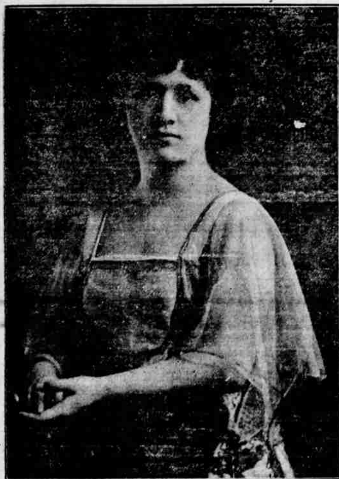
The Singer with a Voice of Gold—Protege of Caruso (Singing for the Edison Records)

The Sample Store 24 STORES 109 West First St., ALBANY, ORE.