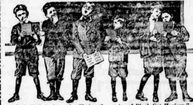
"And all their days, they'll sing the praise of Black Cat Hosiery."

Black Cat Stockings have proved their worth to many a mother in this vicinity; take a tip from them and from us. Don't waste your money buying hose that won't stand the test, but put Black Cat Stockings on your youngsters.