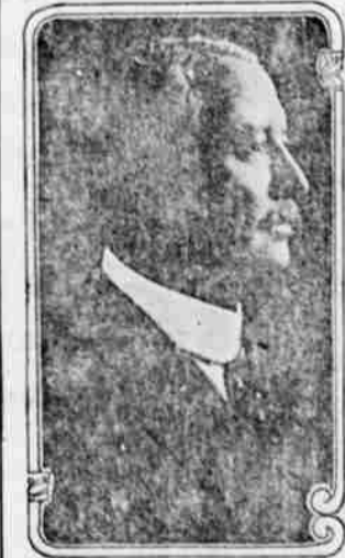
JAMES K. LYNCH Governor, 12th Federal Reserve District

To the Citizens of the Twelfth Federal Reserve District: The Fifth "Victory" Liberty Loan is in sight. Let us thank God that it is not just the Fifth Loan. Victory means the end of the war, the end of loans, the dawn of peace and prosperity. It means that the market price of government bonds will soon stabilize at par or better. It also means that commercial, agricultural, and industrial affairs will stabilize, and that the Hun-inspired clamor will cease.