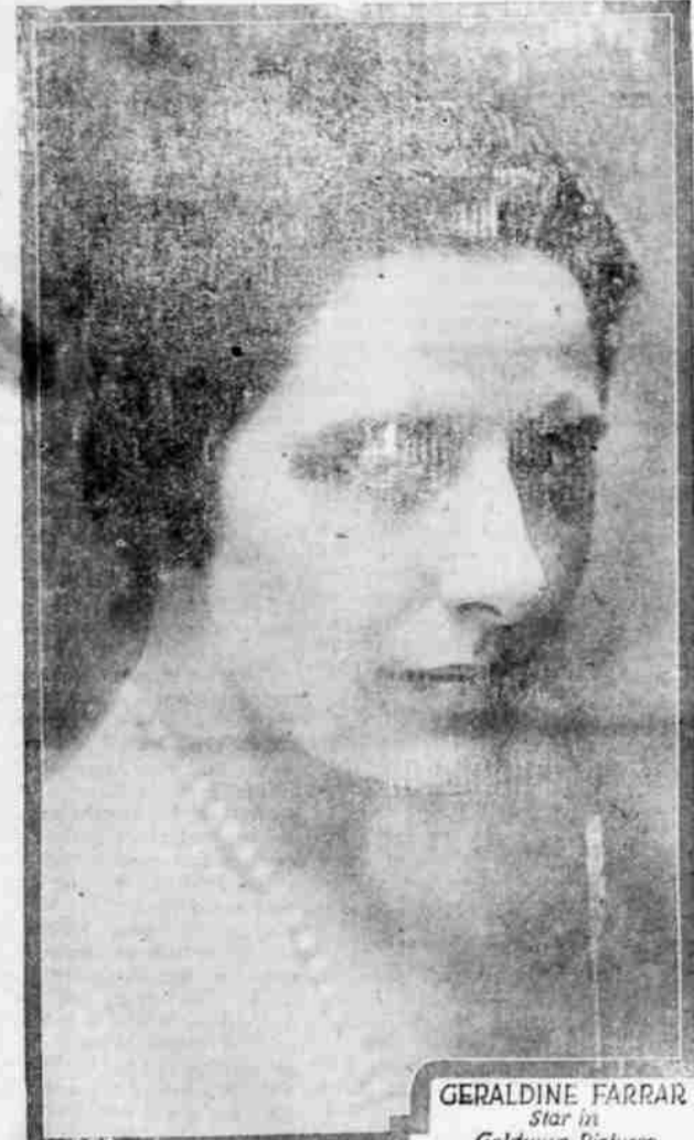
GERALDINE FARRAR Star in Goldwyn Pictures

MEND IT A few cents' worth of work by one who knows how will frequently reclaim from the scrap heap a useful article worth many dollars. Electrical household devices save time and labor for patriotic work. The government asks us not to buy new appliances when the old ones can be mended—most old ones can. Let us tell you how little it will cost. Telephone us today—you will incur no obligation. MOUNTAIN STATES POWER Co. 306 West Second Both Phones 15