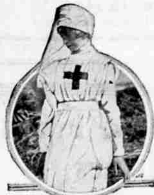
LILLIAN GISH IN D.V. GRIFFITH'S 'The Great Love' An ADVERTISING Piece

also CURRENT EVENTS ADMISSION PRICES—15c to 35c Loge Seats 50c