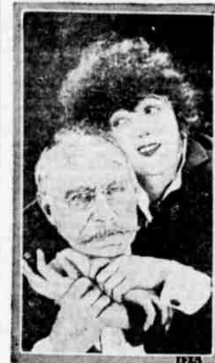
MABEL NORMAND "THE FLOOR BELOW" COLDWYN PICTURES At THE Rolfe Tonight