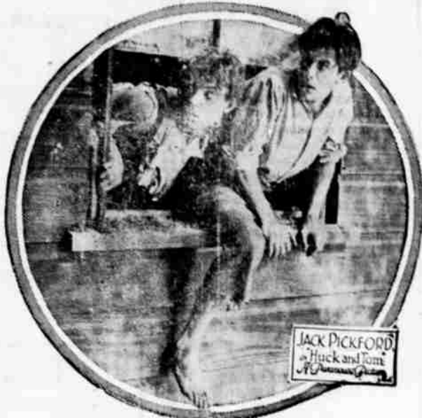
At THE GLOBE Saturday