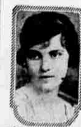
MADGE KENNEDY, Columbia Pictures Star

also—A CAPITAL BILLY PARSON COMEDY Usual Prices