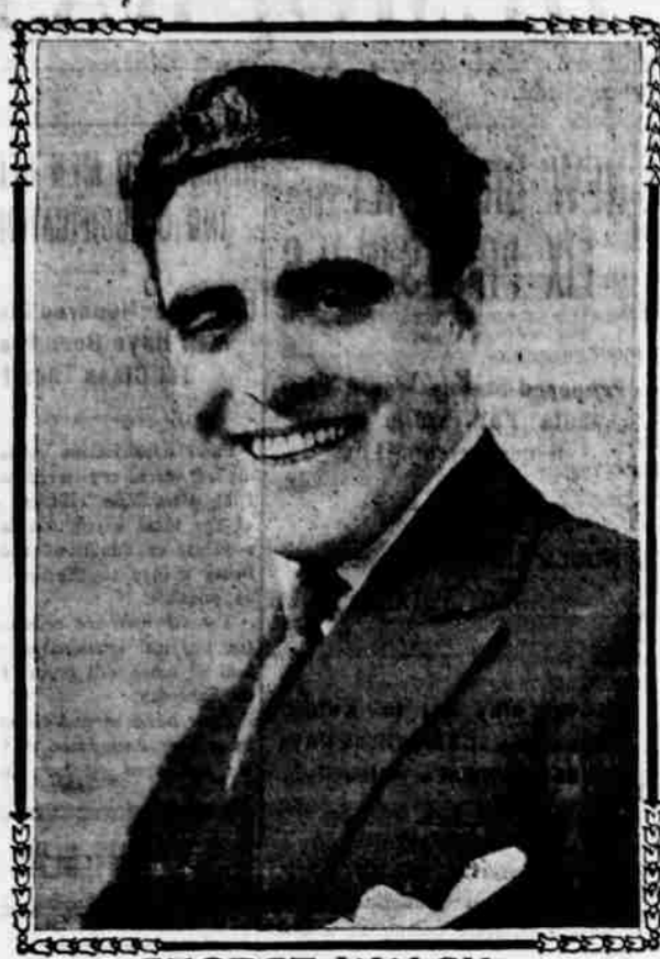
GEORGE WALSH DIRECTION WILLIAM FOX

George Walsh, coming to the Rolfe Wednesday, in "This Is the Life."