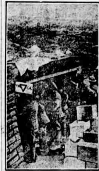
A Red Triangle Dugout in the Trenches.

If every thinking citizen could see with his or her own eyes something of the actual work being done for our men by the association there would be no question of the Y. M. C. A. having to appeal to the public for money. Rather than let this essential work falter for an instant rich men would sell their motorcars, poor men would