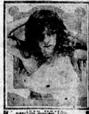
Joan Sawyer, noted dancing star coming to the Rolfe soon in a William Fox play.

When the Father of Waters comes to town with all his family, as he does every ten or eleven years, we hope at some near time hereafter to exert a control over our visitor through the many millions congress has provided.