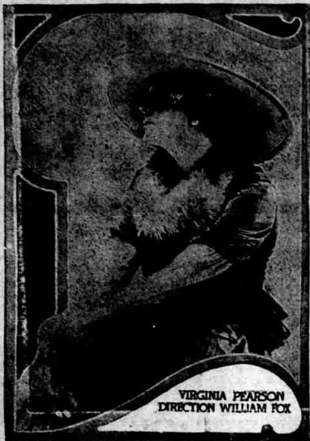
VIRGINIA PEARSON DIRECTION WILLIAM FOX

The beautiful Southern Girl in an intensely interesting play of a double role