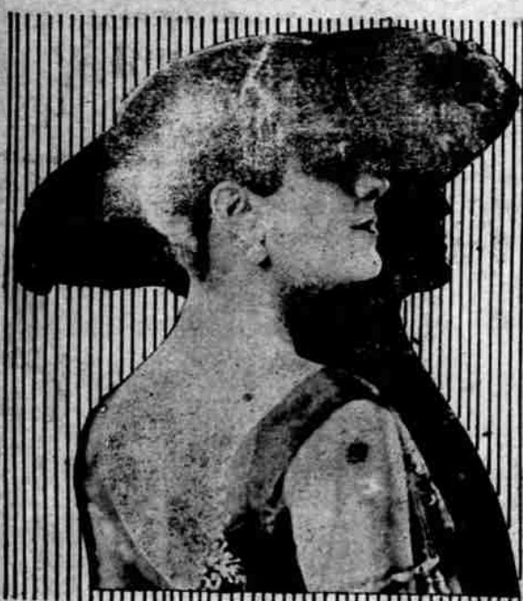
VALESKA SURATT—Direction William FOX

The Empress of Fashion in the WILLIAM FOX