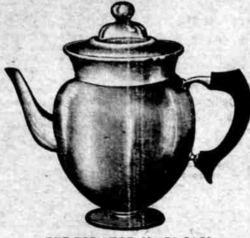
PERCOLATOR No. 76, $4.50

FOR THE BEST LOAF If home made bread we will give a Universal Nickel Plated Coffee Urn.