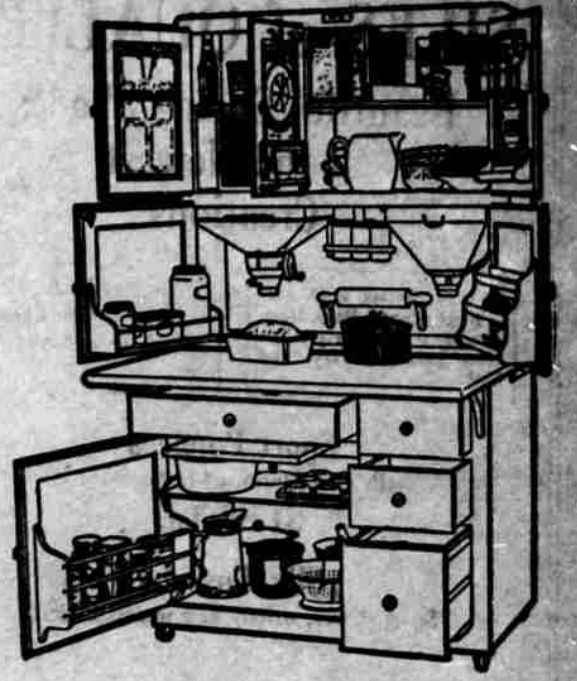
"HOOSIER BEAUTY," Hinged Door Cabinet