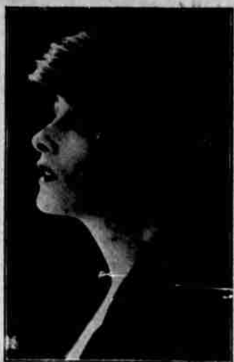
Marie Doro, at the Globe Monday in "Common Ground."