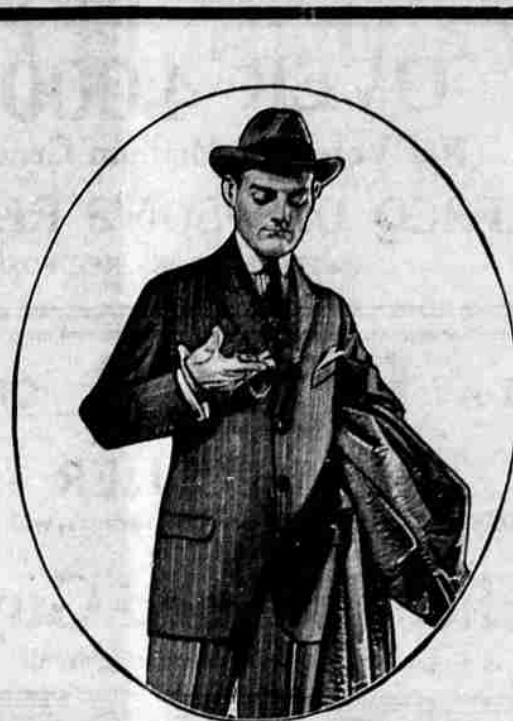
Copyright 1916 The House of Kuppenheimer

You want to be well but not extrayagantly dressed; stylishly but not radically dressed