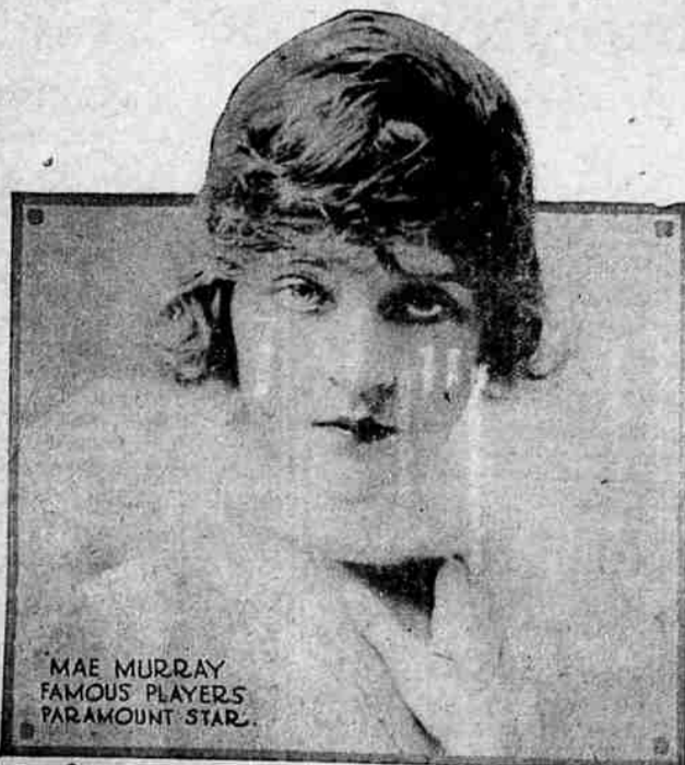
MAE MURRAY FAMOUS PLAYER'S PARAMOUNT STAR.

Matinees . . . 15c Children . . . 10c Evenings . . . 25c Children . . . 15c