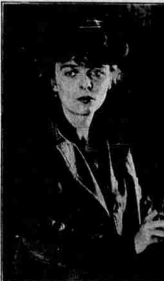
BLANCHE SWEET Popular Paramount star, in boy's clothes in the Lasky production, "The Ragamuffin," at the Globe tonight.

The excursion train taking the Albany people to Philomath to the Round-Up tomorrow will leave the S. P. depot at 12:55 p. m. A large number will attend from here. The round trip fare is 70 cents.