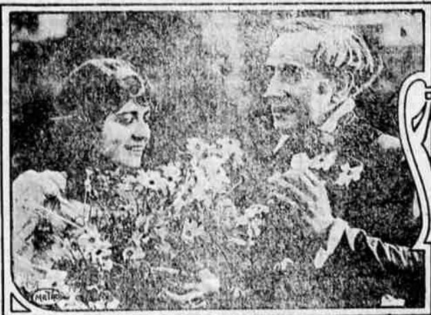
SCENE FROM ROSEMARY A delightful drama of youth and old age. No prettier play written COMING FRIDAY Wm. Farnum in "FIGHTING BLOOD"

ROLFE THEATRE TONIGHT ONLY Last chance to see the enchanting screen star Marguerite Snow and the gifted young dramatic actor Paul Gilmore, in "ROSEMARY"