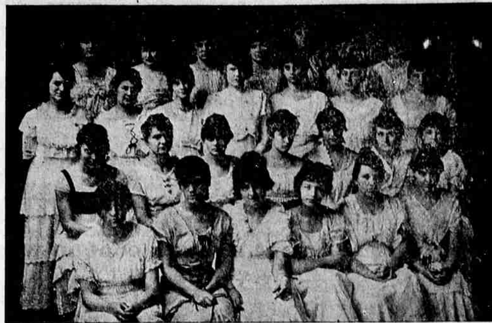
Women's Glee Club of the U. O. to appear in concert at the Globe on Tuesday, April 25.