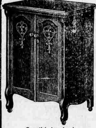
Beautiful when closed

The FREE is for the busy woman—It sews faster THE FREE is for the weak woman — It runs lighter, The FREE is for the nervous woman — It runs noiseless,