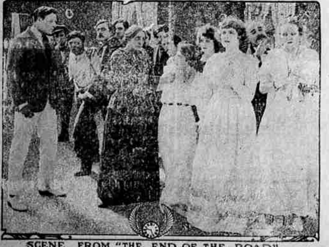
SCENE FROM "THE END OF THE ROAD" FIVE-ACT MUTUAL MASTERPICTURE MADE BY AMERICAN Rolfe Theatre tonight and To-day.