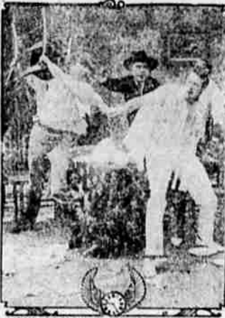
SCENE FROM "THE END OF THE ROAD" FIVE-ACT MUTUAL MASTERPICTURE MADE BY AMERICAN