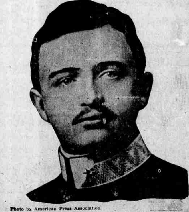
Heir to Austrian Throne Leads Nation's Army

London, Jan. 28.—Emperor Franz Joseph suffered a severe chill and is growing weaker and more depressed, a Copenhagen dispatch reported.