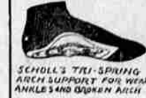
SCHOLL'S TRI-SPRING ARCH SUPPORT FOR WEAR, ANKLES AND OTHER ARCH