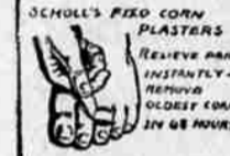
SCHOLL'S FIXO CORN PLASTERS RELIEVE PAIN INSTANTLY—REMOVE OLD CORNS IN 48 HOURS